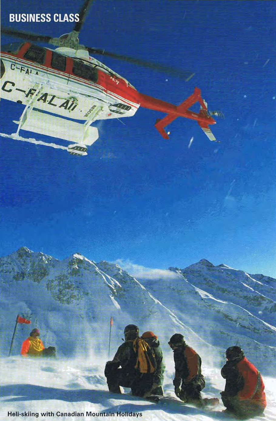
Heli-skiing with Canadian Mountain Holidays