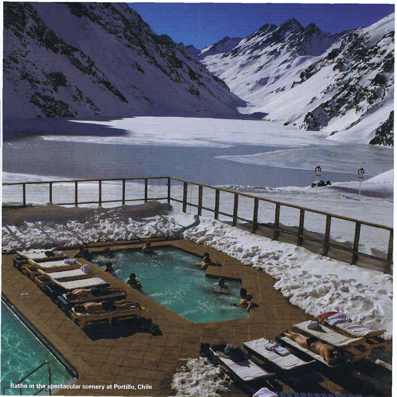
Bathe in the spectacular scenery at Portillo, Chile

tation dine at Summit Ridge Lodge before supping on your choice of more than 70 vodkas at Astra Bar.